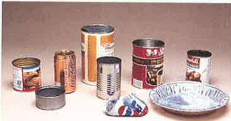
acceptable cans & metals

Green, brown and clear bottles and jars. Remove lids and rinse containers.