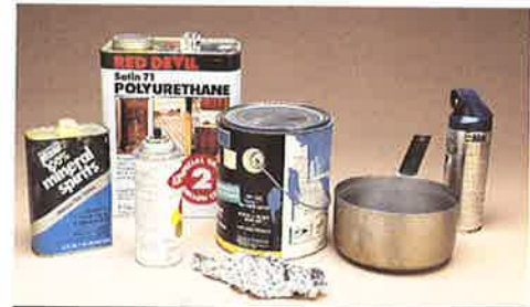
unacceptable metal & cans

No window glass, light bulbs, drinking glasses, broken bottles, mirrors, kitchenware or pyrex glass.